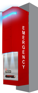
Surface or Pole Mount