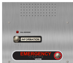
1 or 2 Buttons