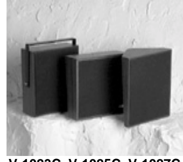
V-1023C, V-1025C, V-1027C

Valcom One-Way Amplified Interior Speakers, V-1016-W, V-1016-BK, V-1022C, V-1023C, V-1024C, V-1025C, V-1026C, V-1026C-W, V-1027C, are self-amplified and capable of reproducing paging as well as background music. These speakers have externally accessible volume controls that are screwdriver adjustable. The enclosures are vinyl laminated pressboard with either a coordinating cloth or woven can grille. All speakers require -24 Vdc, 50 mA (1 power unit) and are FCC Part 68 registered under BAFUSA-69358-KX-N.