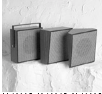
V-1022C, V-1024C, V-1026C