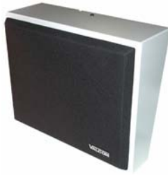
V-WTGY Wall Mount Speaker Gray W/ Black Grille