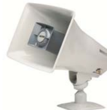
VIP-130L One-Way 5-Watt High Efficiency IP Horn w/Long Line Extender (BG) Beige (GY) Gray M) Marine