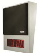
VIP-411-DS One-Way Wall Mount IP Speaker Gray w/ Black Grille, w/ Digital Clock