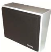
VIP-410 One-Way Wall IP Speaker Gray w/ Black Grille, Paintable Body