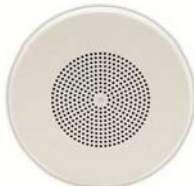
VIP-120A One-Way 8" Round Ceiling IP Speaker