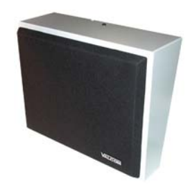
V-1052C Amplified Wall Mount Speaker Gray w/Black Grille

NOTE: Do not connect this speaker directly to a 25/70/100 Volt amplifier as damage to both the amplifier and speaker may occur. A V-1095 may be used to allow the use of Valcom self-amplified speakers on 70 Volt speaker lines.