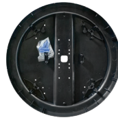
12-inch housing wireless analog clock