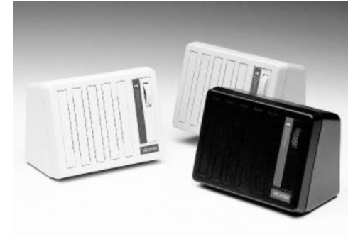
MODEL NO. V-762