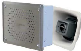
VIP-480L One-Way IP Horn w/ Long Line Extender Vandal-Resistant Enclosure (optional)