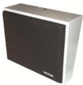
VIP-410 One-Way Wall IP Speaker Gray w/ Black Grille, Paintable Body