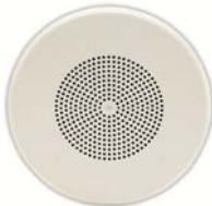
VIP-120A One-Way 8" Round Ceiling IP Speaker