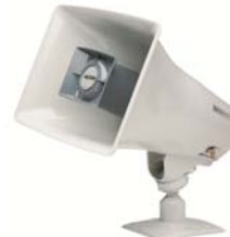
VIP-130L One-Way 5-Watt High Efficiency IP Horn w/ Long Line Extender (BG) Beige (GY) Gray M) Marine