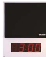
VIP-412-DF One-Way Flush Mount IP Speaker Gray w/ Black Grille, w/ Digital Clock